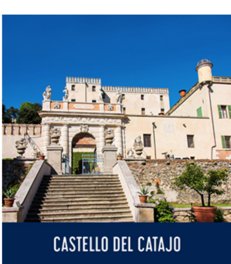
CASTELLO DEL CATAJO

Also known as Cochem Castle, this hilltop gem is as charming as the pretty town below it. You'll see why the Reichsburg is a favourite of visitors to Germany on our Magnificent Moselle & Rhine cruise.