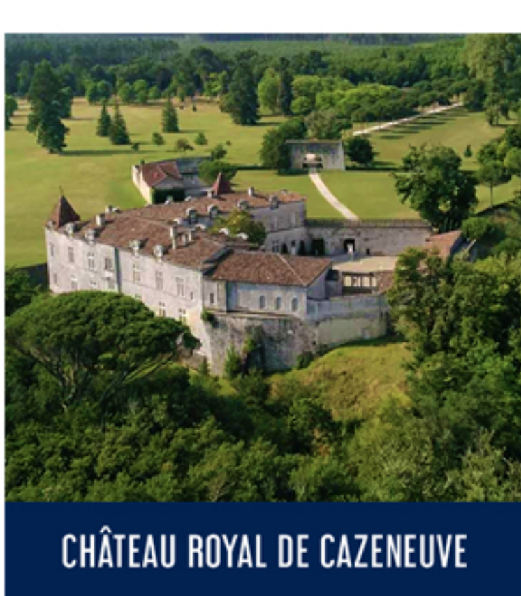
CHÂTEAU ROYAL DE CAZENEUVE

Hidden in the Paduan countryside that could compete against the most beautiful in Europe, if only more people knew it existed. Discover the gorgeous estate for yourself on Milan, Venice & the Jewels of Veneto .