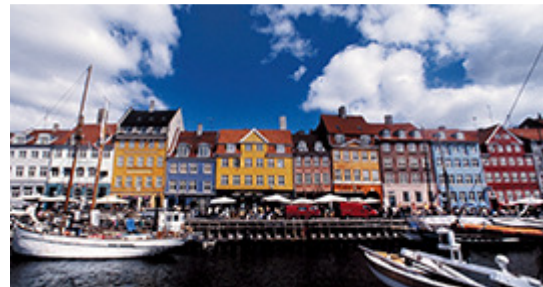
View Voyage #11429