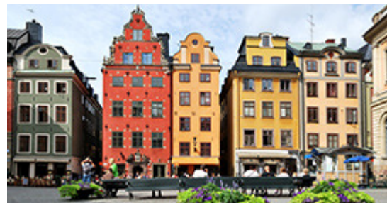
View Voyage #11423