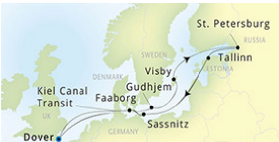
Dover - Dover