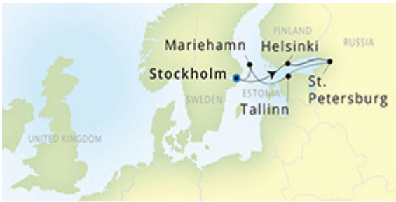
Stockholm - Stockholm