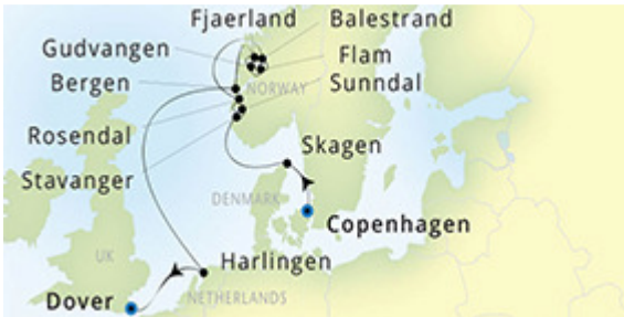
Copenhagen - Dover