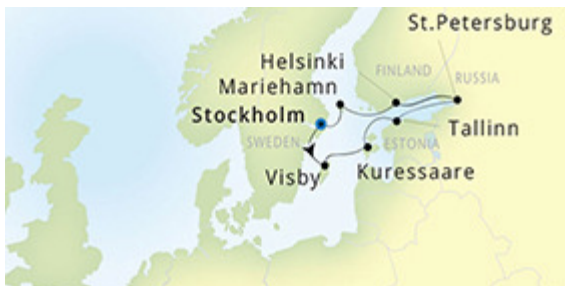
Stockholm - Stockholm

CLICK HERE TO BROWSE OUR NORTHERN EUROPE VOYAGES