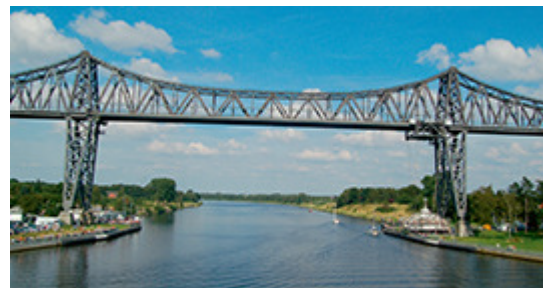
View Voyage #11430

We recently created a new brochure called Summer in Northern Europe. Click here to read it online!