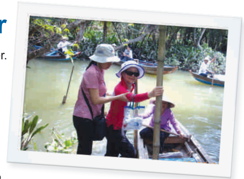
Mekong Delta, Vietnam