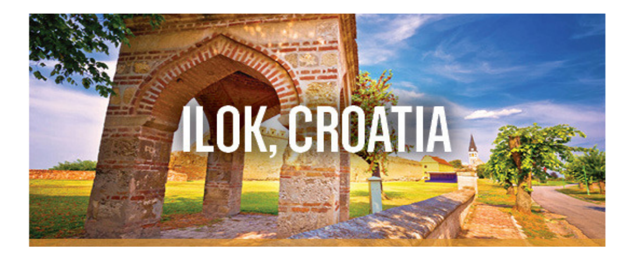
Surrounded by wine-growing hills, Ilok is the easternmost town in Croatia. Here you will delve into the town's 1,000-year-old wine-making tradition and explore Ilok's cultural heritage, protected by a medieval fortress.

Broadening your possibilities to experience Croatia, Serbia, Romania and Austria, here are four new ports you can dream about until you drift back to the world's waterways.