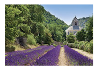
AIX EN PROVENCE & MARSEILLE

Enjoy a lovely drive into the Provençal countryside bringing you to the charming old town of Aix-en-Provence.