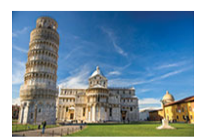
THE GLORIES OF PISA

Discover Pisa's renowned Leaning Tower during a halfday tour of the city's beautiful and historic Campo dei Miracoli.